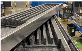
100% customizable design, including interior configuration, to best fit your specific needs and requirements.

We are the industry experts. We don't just research the industry standards and regulations; we actively contribute to the writing process and assist regulatory bodies in the practical application of these requirements. When you use Americase, you get the peace of mind that your hazardous materials, dangerous goods, or high value products, will be safely transported, stored, and moved through your manufacturing and supply chain with the complete confidence that you meet all current, and known, upcoming regulations.