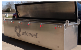
Rugged, waterproof construction for 10+ years of field life.