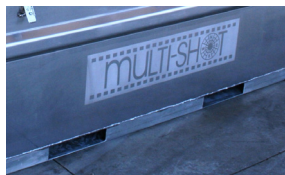
Each case can be lifted either by forklift, hoist, or crane, depending on the weight.

With 50+ years of case design and manufacturing experience, a full in-house design and engineering department, precision fabrication, and one of the best production units in the industry, we offer the solutions to complex problems and capability to overcome any challenge.