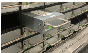
BBUs are separated for shipping and storage for safety.