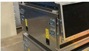
Stackable design allows for smaller footprint and increased storage capacity.

We are the industry experts. We don't just research the industry standards and regulations; we actively contribute to the writing process and assist regulatory bodies in the practical application of these requirements. When you use Americase, you get the peace of mind that your hazardous materials, dangerous goods, or high value products, will be safely transported, stored, and moved through your manufacturing and supply chain with the complete confidence that you meet all current, and upcoming regulations.