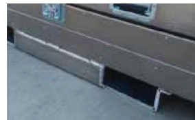
Designed to be liftable by forklift or pallet jack for easy handling.

With 50+ years of case design and manufacturing experience, a full in-house design and engineering department, precision fabrication, and one of the best production units in the industry, we offer the solutions to complex problems and capability to overcome any challenge.