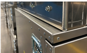
Stainless steel hinges and hardware for longevity and durability.